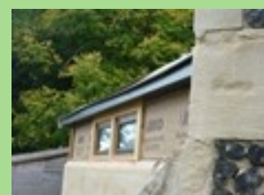
The new toilet block at St Michael's